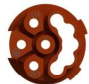
Contact Socket 2.0 mm crimp/ 0.35 - 2.50 mm 2 Item: 60.254.11